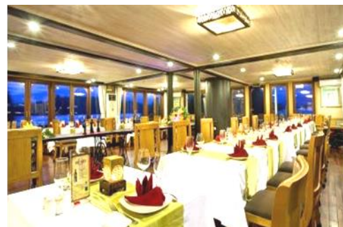
(Glory Legend Cruise)