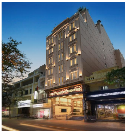
(Thang Long Opera Hotel)