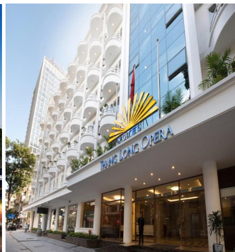
(The Light Hotel)